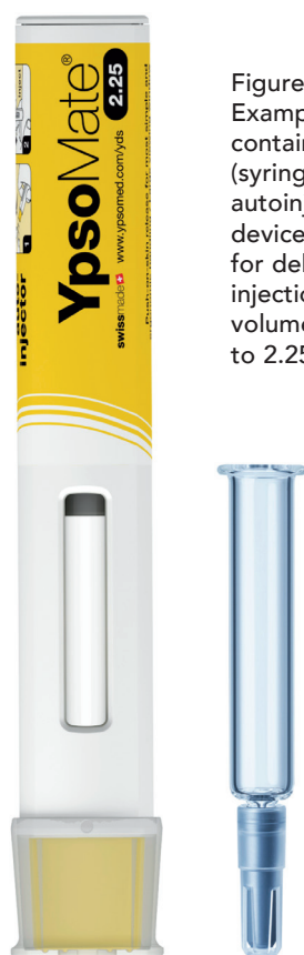
Figure 1: Example container (syringe) and autoinjector device, used for delivering injection volumes up to 2.25 mL.

The use of permeation enhancers (PEs) such as hyaluronidase as a formulation component in SC products has been helpful in expanding SC injection limits toward 10 mL and beyond. PEs temporarily modify the extracellular matrix, degrading hyaluronic acid, thereby facilitating the dispersion of injected fluids due to diminished tissue backpressure. Nowadays, however, there is also clear scientific evidence that injection volumes of 25 mL can be injected subcutaneously without any relevant pain or injection site reactions, even in the absence of any permeation enhancers. 5 Additionally, a technological